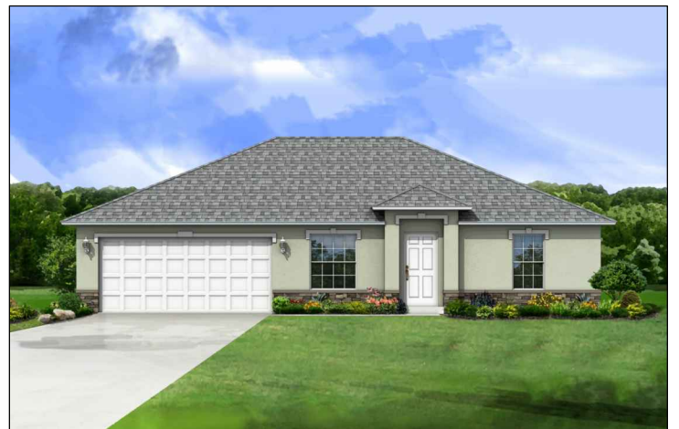
CLASSICAL ELEVATION WITH STONE SKIRT