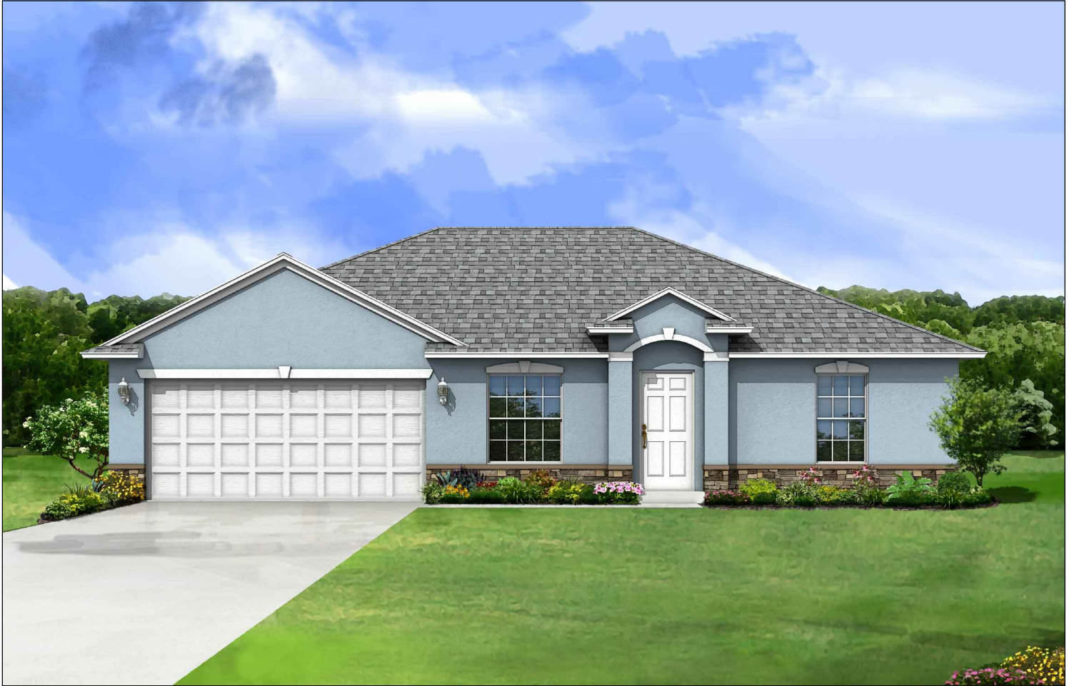
PROVINCIAL ELEVATION WITH STONE SKIRT