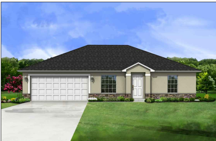
TRADITIONAL ELEVATION WITH STONE SKIRT