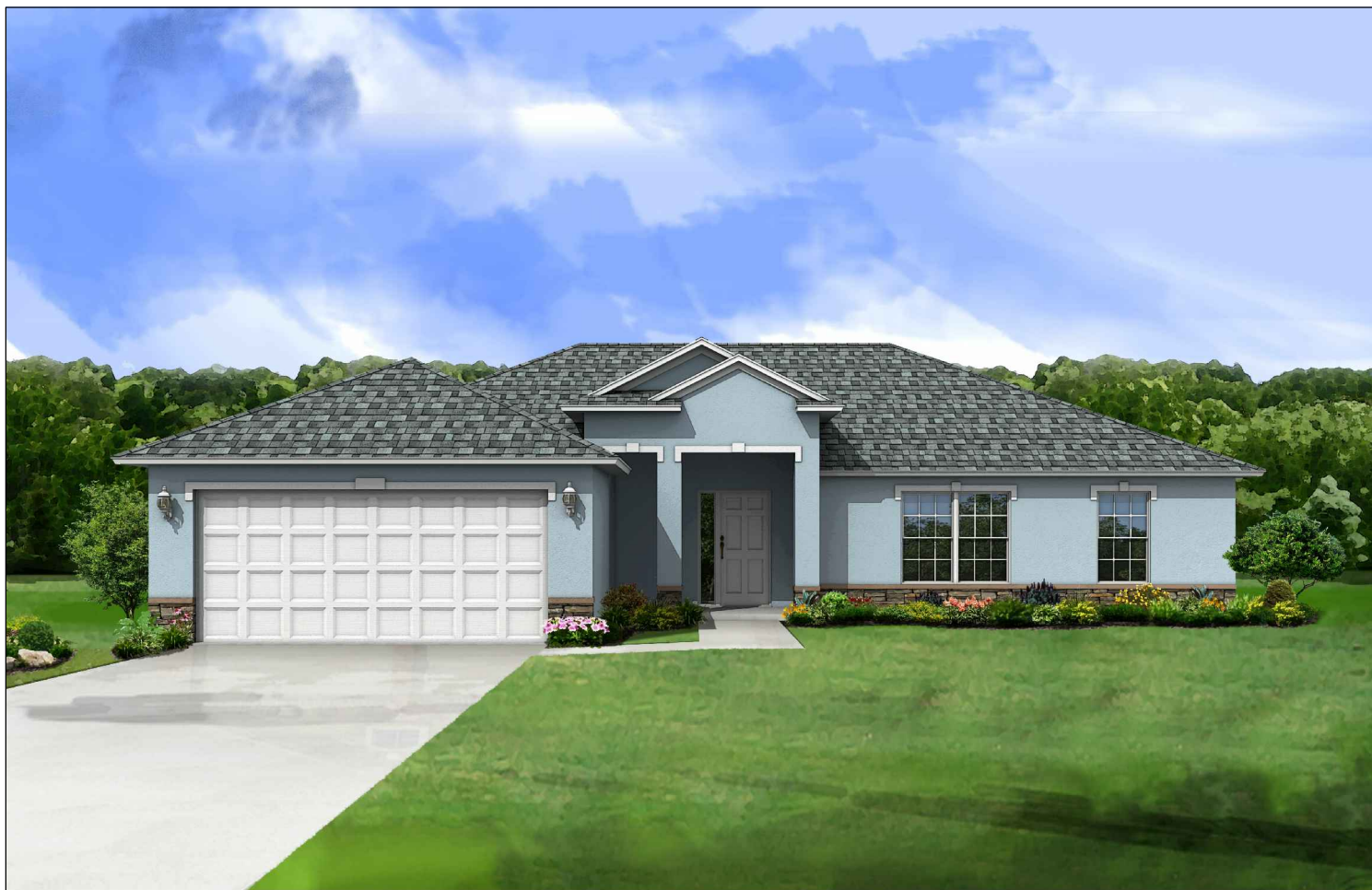
CLASSICAL ELEVATION WITH STONE SKIRT