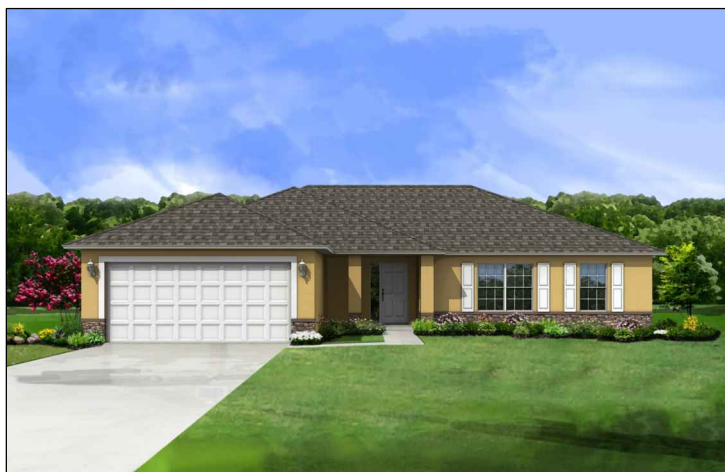
TRADITIONAL ELEVATION WITH STONE SKIRT