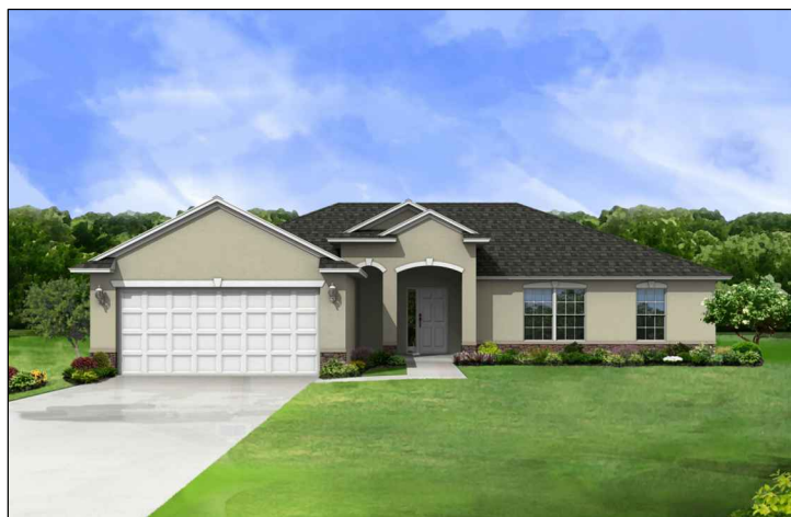
PROVINCIAL ELEVATION WITH STONE SKIRT