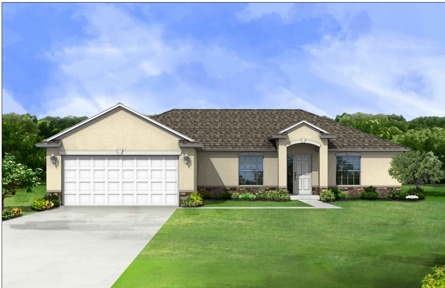
PROVINCIAL ELEVATION WITH STONE SKIRT