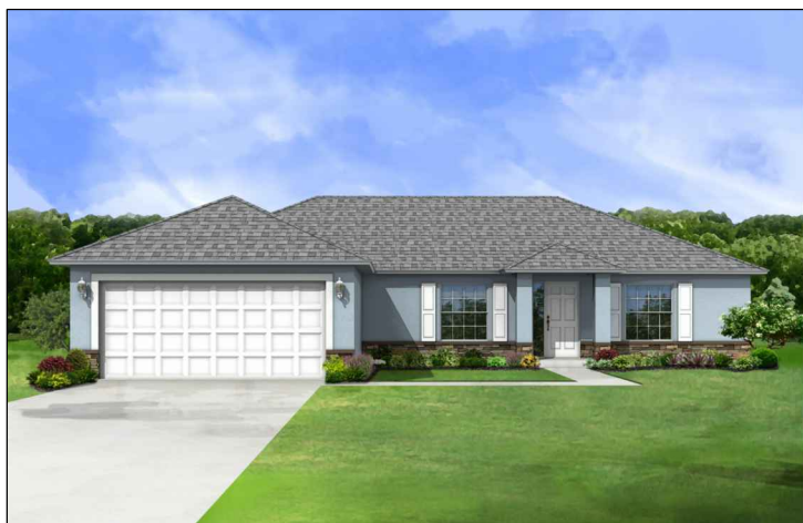
TRADITIONAL ELEVATION WITH STONE SKIRT