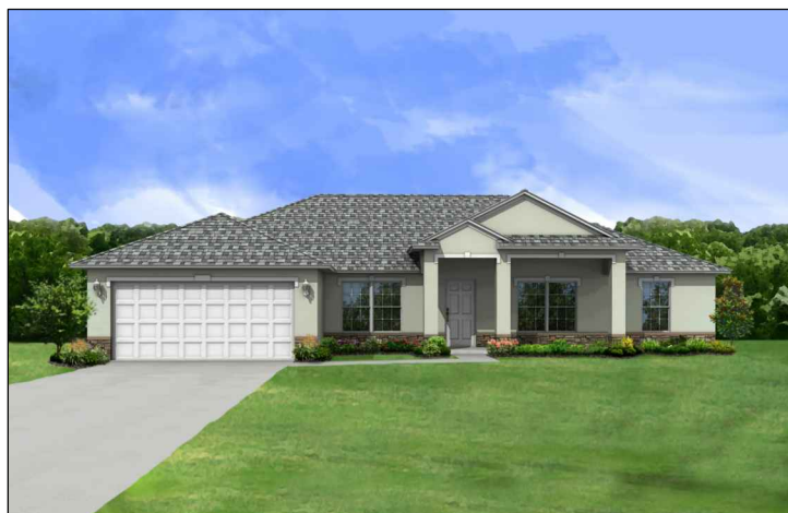
CLASSICAL ELEVATION WITH STONE SKIRT