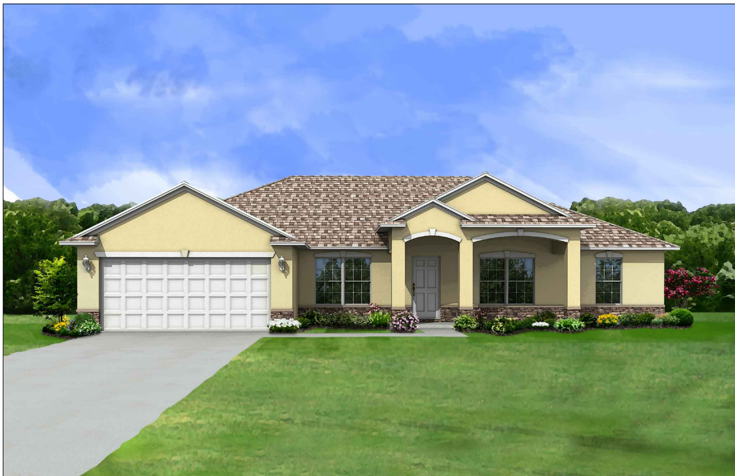
PROVINCIAL ELEVATION WITH STONE SKIRT