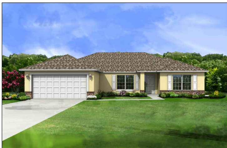
TRADITIONAL ELEVATION WITH STONE SKIRT