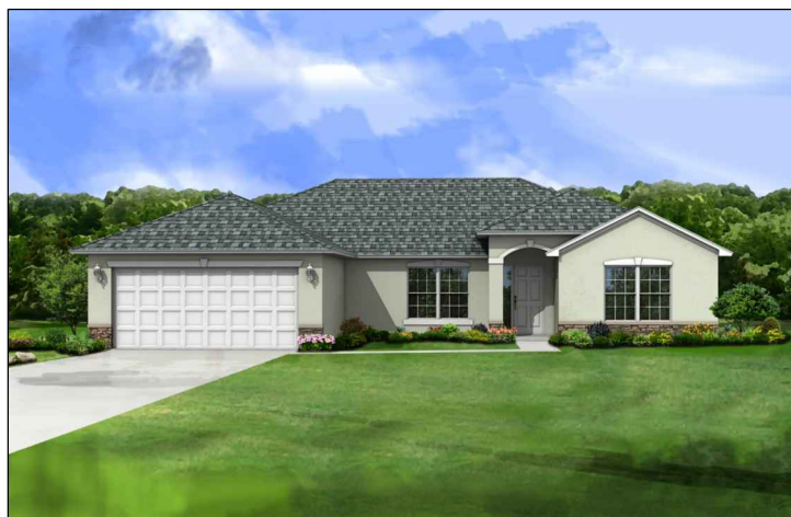
PROVINCIAL ELEVATION WITH STONE SKIRT