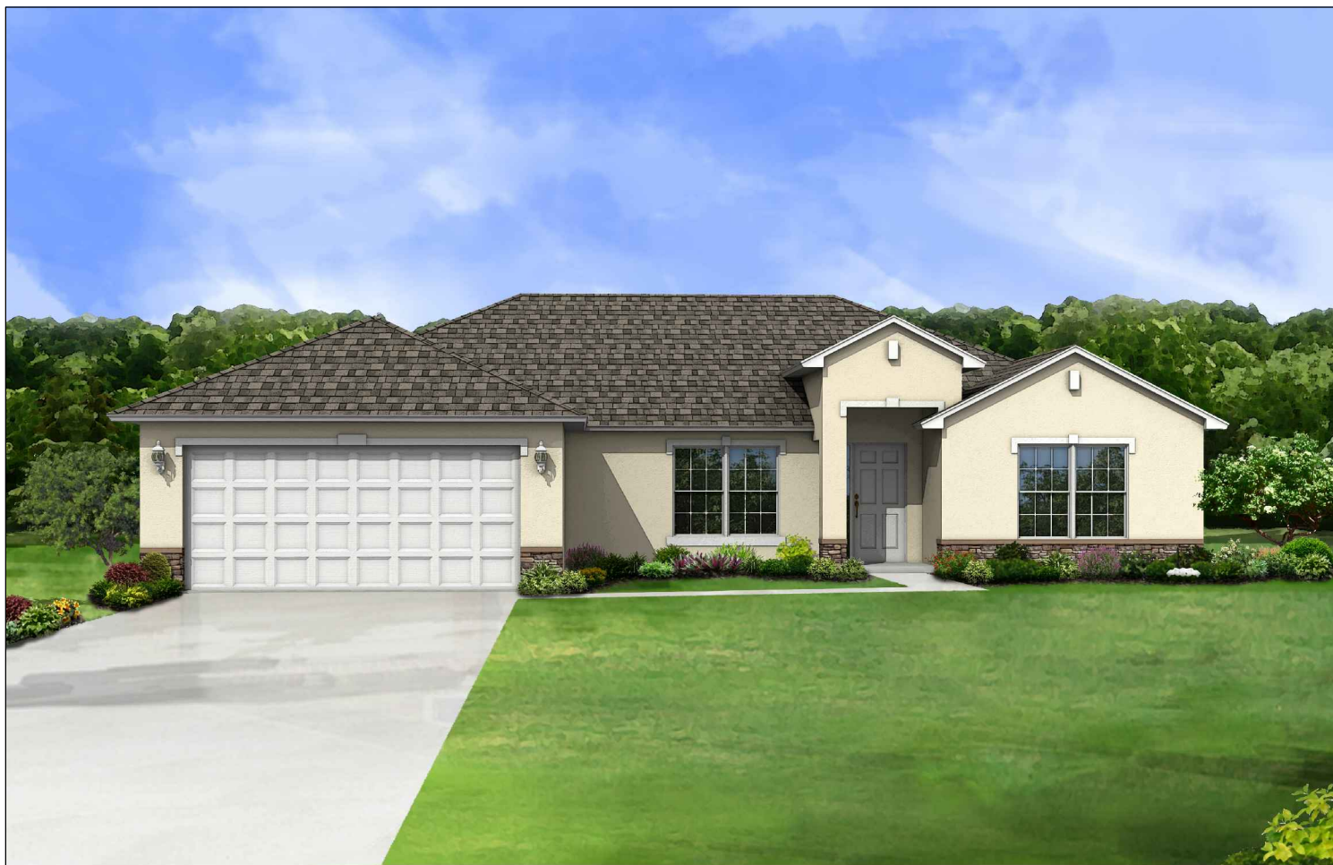
CLASSICAL ELEVATION WITH STONE SKIRT