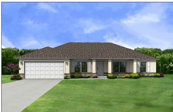
TRADITIONAL ELEVATION WITH STONE SKIRT