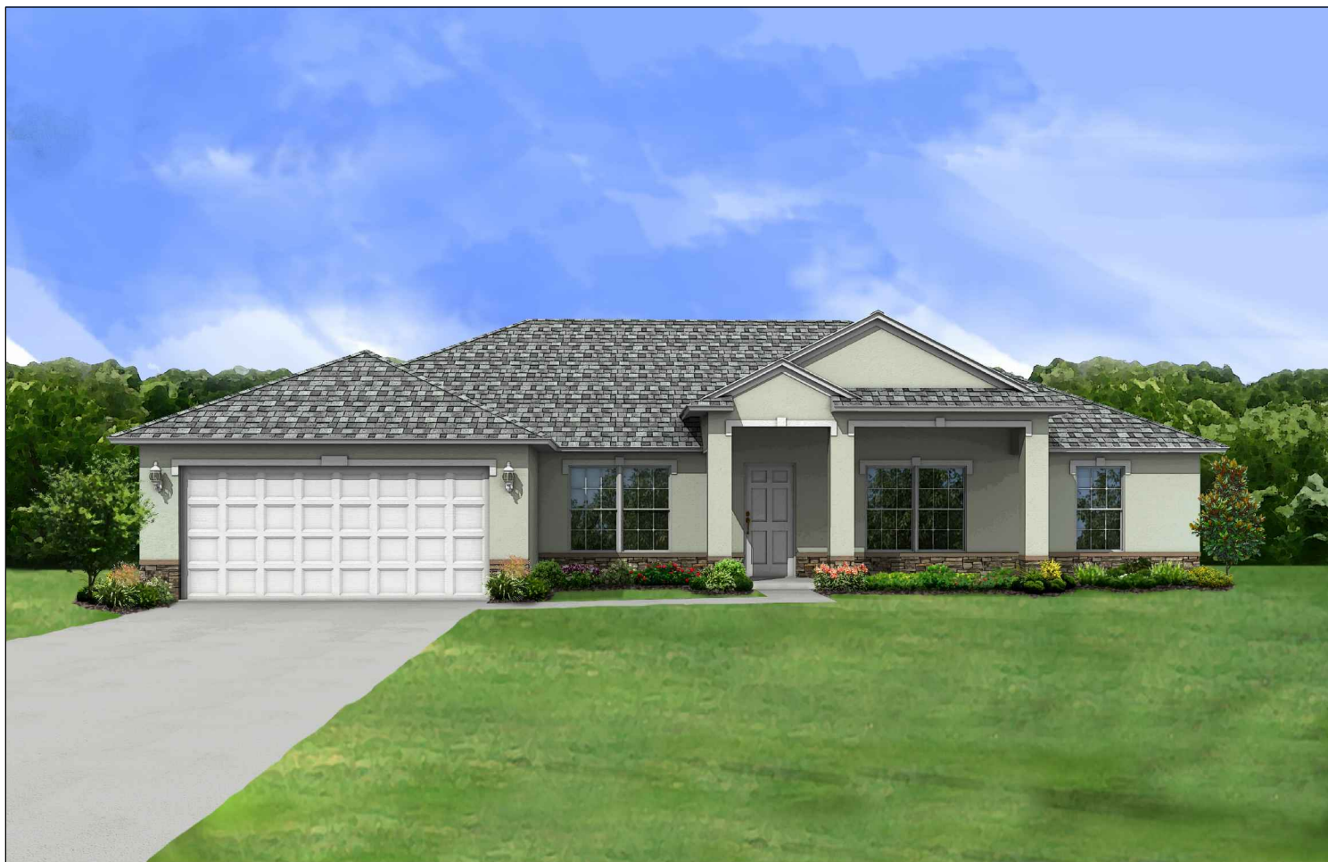
CLASSICAL ELEVATION WITH STONE SKIRT