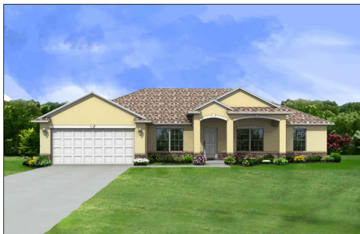
PROVINCIAL ELEVATION WITH STONE SKIRT